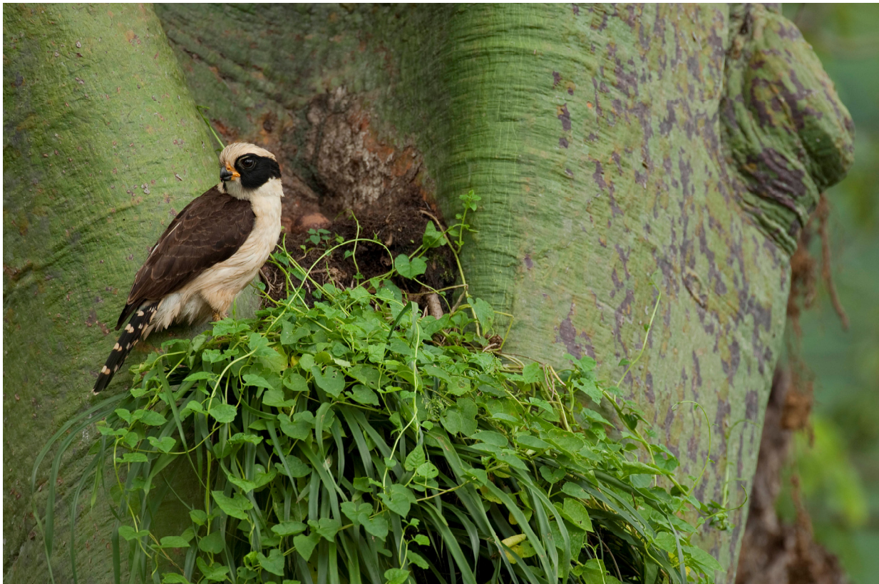
Figure 2. The female Laughing Falcon from the Jorupe nest. The nest can be seen behind and above the epiphytic plants; the egg is visible in the background.

At both nests we documented sex-specific activity patterns and size, type, and rate of delivery of prey items. At the Jorupe nest we also noted nest maintenance behaviors, incubation rhythms, and quantified the average length of duets and the time until and length of syncopation. We defined the beginning of a duet as when the vocalizations between the female and male moved from quiet, occasional calls to regular, insistent calls back and forth between the pair. Syncopation was defined as a regular call and response, where one individual called and the other immediately responded,