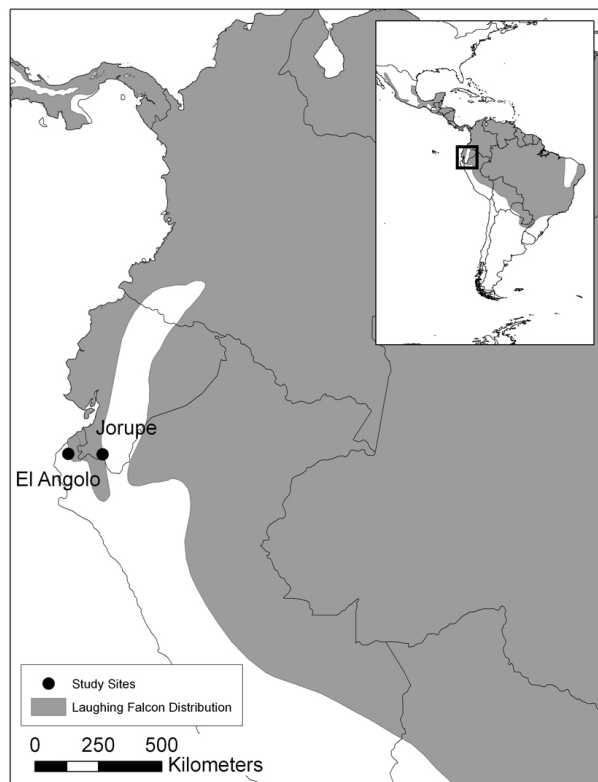
Figure 1. A distribution map of Herpetotheres cachinnans , with El Angolo, Peru and Jorupe, Ecuador, the two study sites, noted. The distribution data were taken from Ridgely et al. (2007) and modified slightly in ArcGIS 9.3 by extending the southern boundary of presence to include the El Angolo nest.

The Laughing Falcon ( Herpetotheres cachinnans ) is a widespread but only locally common diurnal raptor in the Neotropics (Ferguson-Lees & Christie 2001, Fig. 1.). As it occurs at higher densities in edge and disturbed habitats than in closed forests (Parker 1991, Enamorado & Orrego 1992), and across a large geographic area, it might be presumed to have a secure future. Accordingly, it is considered a species of Least Concern (BirdLife International 2010). In some badly fragmented areas, however, such as western Ecuador (Dodson & Gentry 1991), the species is considered uncommon to rare, and perhaps declining (Ferguson-Lees & Christies 2001, Alava et al. 2002), and its specialized diet may limit its success in areas with large human populations (Wetmore 1965).