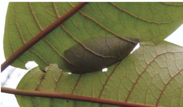
Figure 5. Last instar larval shelter of P. papius .

Larval densities were low (generally no more than one per branch or three per tree) and, due to differences in age of