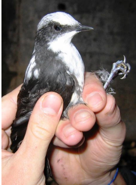
Figure 1. Adult White-capped Dipper ( Cinclus leucocephalus ) near Tandayapa, Pichincha Province, northwestern Ecuador, 1500 m. (Photo: Eliot Miller).

Nest sites and habitat. All nests were directly adjacent to fast-flowing mountain streams in areas where the water was bordered by tall, wet rock faces (or concrete bridge supports). All were situated on these rock faces, wedged into vertical crevices, on sheltered ledges, or in small