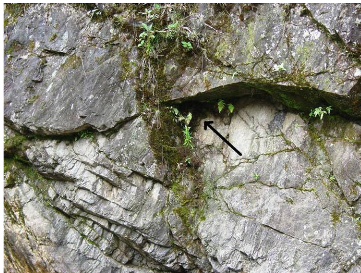
Figure 2. Nest site of White-capped Dipper ( Cinclus leucocephalus ) near Tapichalaca, Zamora-Chinchipec Province, southeastern Ecuador, 1800 m. (Photo: H. F. Greeney).

cavities (Fig. 2). Mean nest height (above the water) was 2.2 \pm 0.9 m. ( n = 8 ; range = 1.2-3.5 m.). Forest around nest sites varied from primary, wet montane forest (Yanayacu and Tapichalaca), to fairly scrubby, drier, disturbed second growth (Tandayapa).