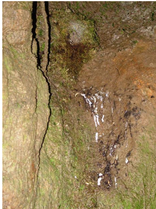
Figure 3. Nest of White-capped Dipper ( Cinclus leucocephalus ) near Tapichalaca, Zamora-Chinchipe Province, southeastern Ecuador, 2200 m.

measured 11.5 \pm 1.8 wide by 12.3 \pm 1.5 tall. Inside this chamber were thickly lined egg cups with mean inner dimensions of 7.7 \pm 1.5 in diameter by 4.7 \pm 0.6 deep. Nests were built by first stuffing moss into irregularities in the substrate rock, creating a ring of moss which was then added to until a completed ball was formed. Nest walls varied in thickness depending on the shape and size of the crevice or niche where the nest was lodged. Once the external, mossy portion of the nest was completed, overlapping layers of tightly compacted bamboo leaves were added to create the cup.