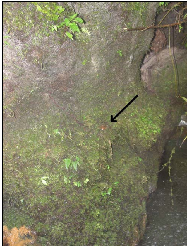
Fig 3. Nesting site of Slaty-backed Chat-Tyrant ( Ochthoeca cinnamomeiventris ), September 2006 at the Yanayacu Biological Station, Napo, Ecuador, 2000 m. Black arrow points to the nest.