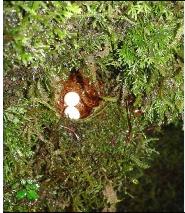
Fig. 1 & 2. Nest of Slaty-backed Chat-Tyrant ( Ochthoeca cinnamomeiventris ), January 2007 and September 2006 respectively. (Photo: H.F. Greeney).