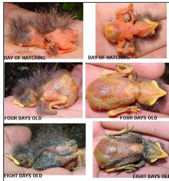
Fig. 6. Nestlings of Slaty-backed Chat-Tyrant ( Ochthoeca cinnamomeiventris ), 0-8 days old, at the Yanayacu Biological Station, Napo, Ecuador showing feather development. Note that exposures vary so that true color may not be properly represented.

patches of grey down adorn the curial (legs) region while a sparse row of bright white down runs down the lateral portion of the ventral abdominal area. Four days later (weight roughly 5.5 – 6.5 g; Fig. 6) the skin turns pinker, with the cloaca bright yellow and more distinctly differentiated from the surrounding skin.