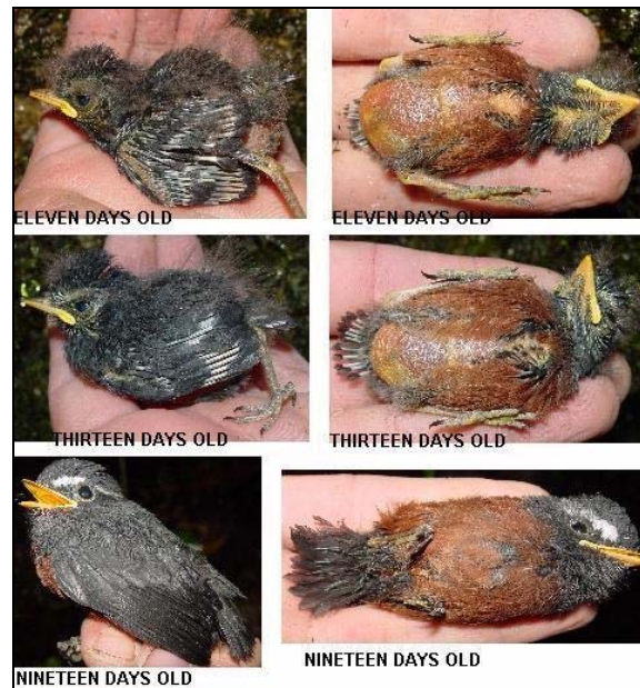
Fig. 7. Nestlings of Slaty-backed Chat-Tyrant ( Ochthoeca cinnamomeiventris ), 11-19 days old, at the Yanayacu Biological Station, Napo, Ecuador showing feather development. Note that exposures vary so that true color may not be properly represented.

cural region remain mostly unbroken. Primary and secondary pinfeathers have not yet broken their sheaths, while rectrices have just begun to break. Nestling down covering has become sparser, but still remains prominent. Three days after this (weight roughly 11.5 – 14.5 g; Fig. 7) soft part color is similar with the legs and upper mandible darker and the ocular area appearing more olive colored. The cloaca is now less well-differentiated from the surrounding flesh, having become darker.