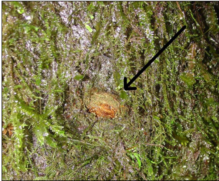
Fig. 4. Nesting site of Slaty-backed Chat-Tyrant ( Ochthoeca cinnamomeiventris ), January 2007 at the Yanayacu Biological Station, Napo, Ecuador, 2000 m. Black arrow points to the nest.

While not quantified directly, I feel that more time was spent in appropriate nesting habitat (see below) during these drier months, and that the peak suggested above may be slightly inflated. My gut feeling, however, is that this is a real pattern. Due to their generally remote location (from the research station), I was unable to closely monitor many nests. At one nest, incubation lasted at least 14 days. At another, two nestlings fledged after 18-19 days. At the most closely monitored nest, the single nestling fledged 20 days after hatching. At least one of the nests examined was built on top of 2-3 old nests, presumably of this species. One nest site was used on at least two consecutive years, and one site has now been used 4+ times during the past 6 years. For the above description of nest height and site selection, each of these was counted only once.