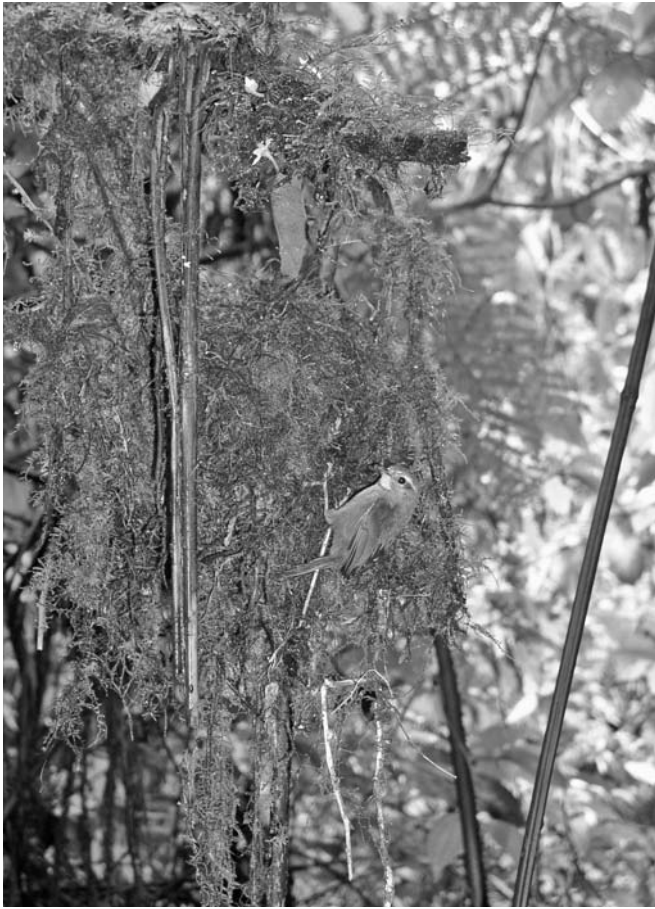
FIGURE 1. An adult White-browed Spinetail ( Hellmayrea gularis ) perched outside the entrance of a nest just after feeding nestlings in southeastern Ecuador.

species to Cranioleuca (Braun and Parker 1985, García-Moreno et al. 1999), or to form part of a clade including other synallaxine genera ( Anumbius , Coryphistera , and Phacellodomus ; Irestedt et al. 2006), its nest architecture does not support any of these relationships. With the exception of Cranioleuca , the aforementioned synallaxines form a clade based on detailed nest synapomorphies (Zyskowski and Prum 1999), none of which are shared with Hellmayrea . In contrast to Hellmayrea , these synallaxines construct domed nests of dry sticks; some have long entrance tubes, thatch, and lining of pubescent leaves ( Synallaxis ); some are entered from above and adorned with conspicuous objects around the entrance ( Anumbius , Coryphistera ); and some are semipensile with a constricted entrance tunnel ( Phacellodomus ; Zyskowski and Prum 1999). Although it is possible that some of these nest characters are the result of these birds inhabiting dry, open environments, the architecture of Hellmayrea nests is dissimilar in too many respects to hypothesize a sister relationship with the aforementioned genera based on nest architecture.