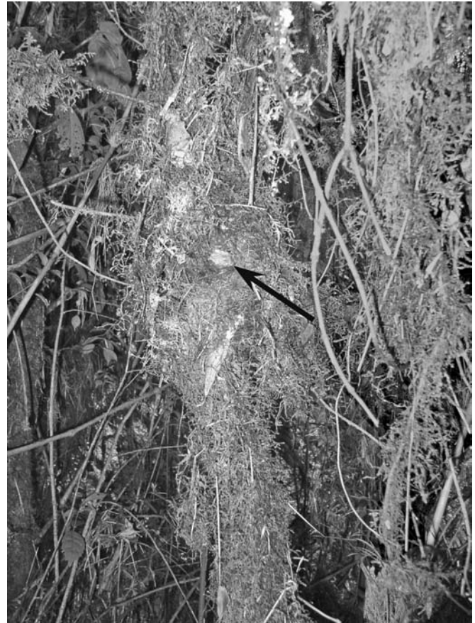
FIGURE 2. A White-browed Spinetail ( Hellmayrea gularis ) nest built into a hanging clump of vines and epiphytes in southeastern Ecuador. The arrow indicates the nest entrance.

The sister relationship between Hellmayrea and Cranioleuca is also not supported by nest architecture. Nests of Cranioleuca spinetails lack bamboo leaves, Tillandsia seed down, and tree-fern scales, and instead incorporate other plant materials, such as woody twigs, rootlets, bark strips, and grass (Remsen 2003; KZ, pers. obs.). Although pensile mossy nests of some