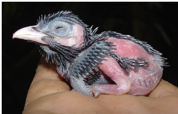
Figure 2. Photo of nestling of White-fronted Nunbird Monasa morphoeus nestling, 7 January 2007, Shiripuno Research Center, Pastaza, Ecuador.

Also on 7 January 2007, we discovered a pair of