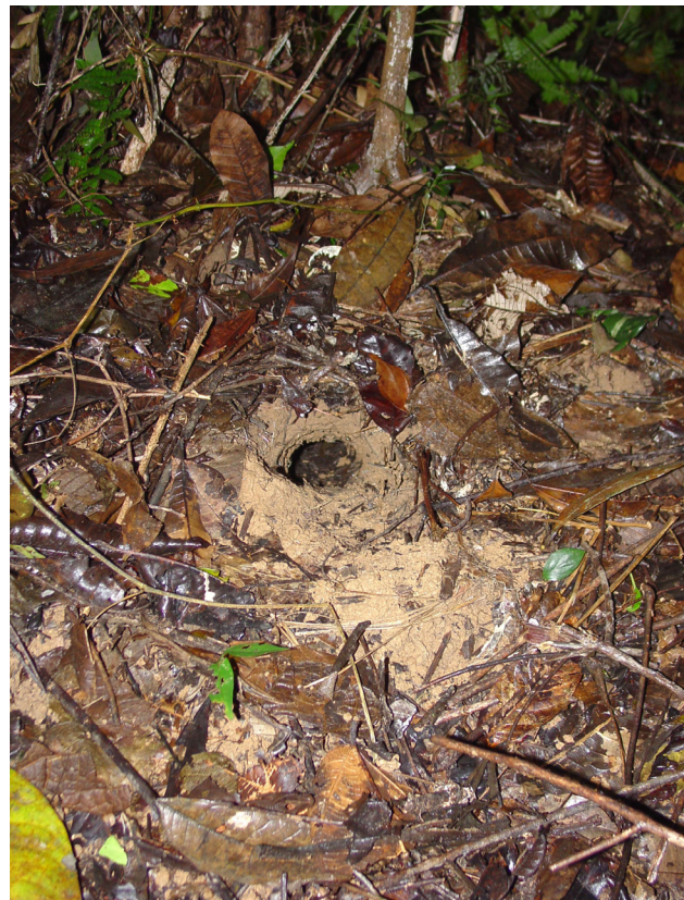
Figure 3. Nest entrance of Black-fronted Nunbird Monasa nigrifrons , 2 February 2006, Shiripuno Research Center, Pastaza, Ecuador.

On 2 February 2006, we found a nest of Black-fronted Nunbird with a single well-feathered nestling. The following day the nest was empty and there were no signs of disturbance. The nest was a 60 cm long tunnel excavated in gently sloping